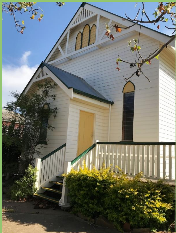
Wandoan Presbyterian Church QLD

Public Worship & Aids to Devotion Committee Presbyterian Church of Australia